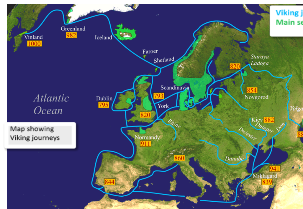
Map showing Viking journeys