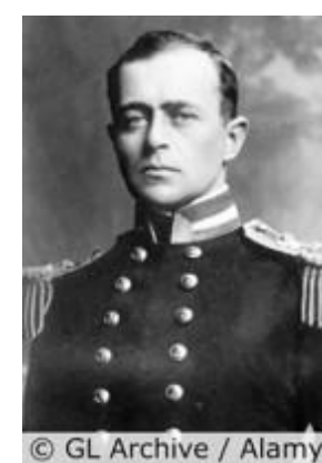
Captain Robert Scott