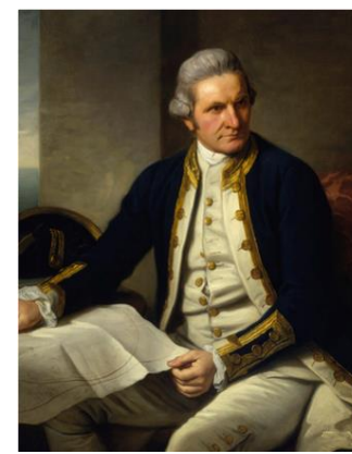
Captain James Cook