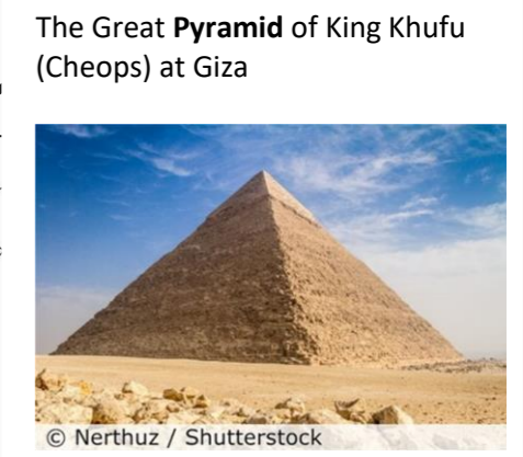
The Great Pyramid of King Khufu (Cheops) at Giza

The River Nile was important. Egyptian people built irrigation systems along the Nile.