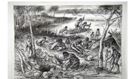
© From an original drawing by Alan Sorrell