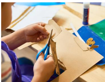
Junk Model Train

Please bring in all your recycling from home we really appreciate the continued drop ins to add to our collection!