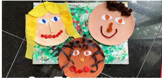
Paper Plate SELF PORTRAITS

As artists will be learning creative skills to create self portraits and pictures of our friends and family.