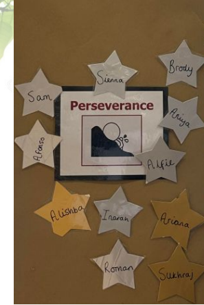
Our school values and recognition board